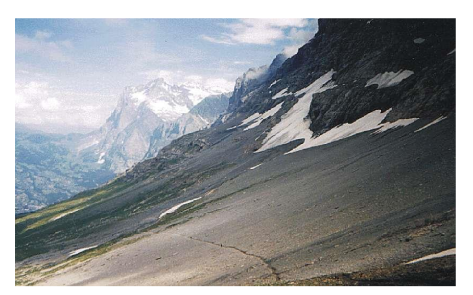
Figure 2 – An ideal location for the new laboratory

Please be aware that coloured diagrams and photographs frequently do not convert sensibly to black and white presentation. Again, it is